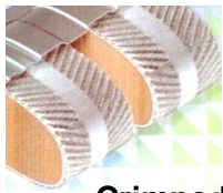
Crimped Mesh Substrate Support